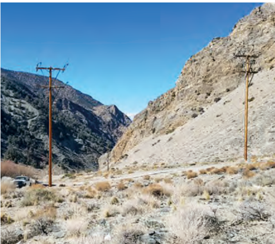
SCE will work with the Bureau of Land Management and Inyo National Forest to protect environmental and recreational opportunities.