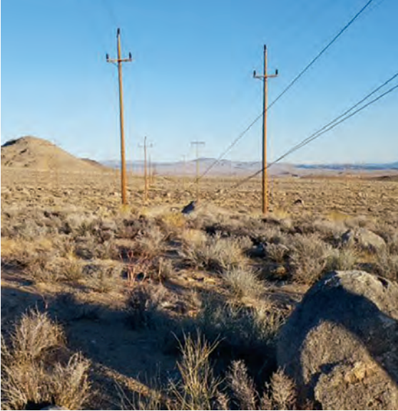
The Control-Silver Peak Project will enhance safety of SCE's sub-transmission system in portions of Inyo and Mono counties.