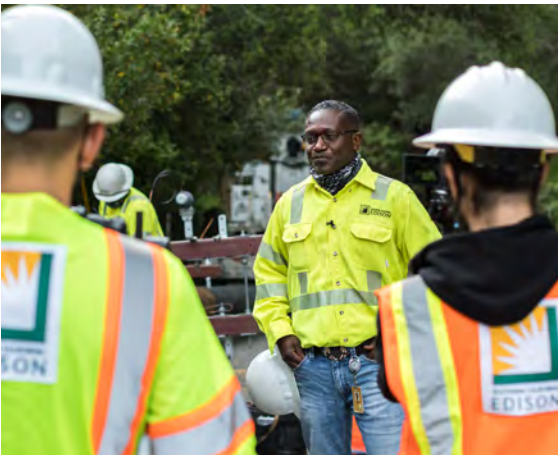
The project, which is in initial planning, would follow standards of the California Public Utilities Commission.